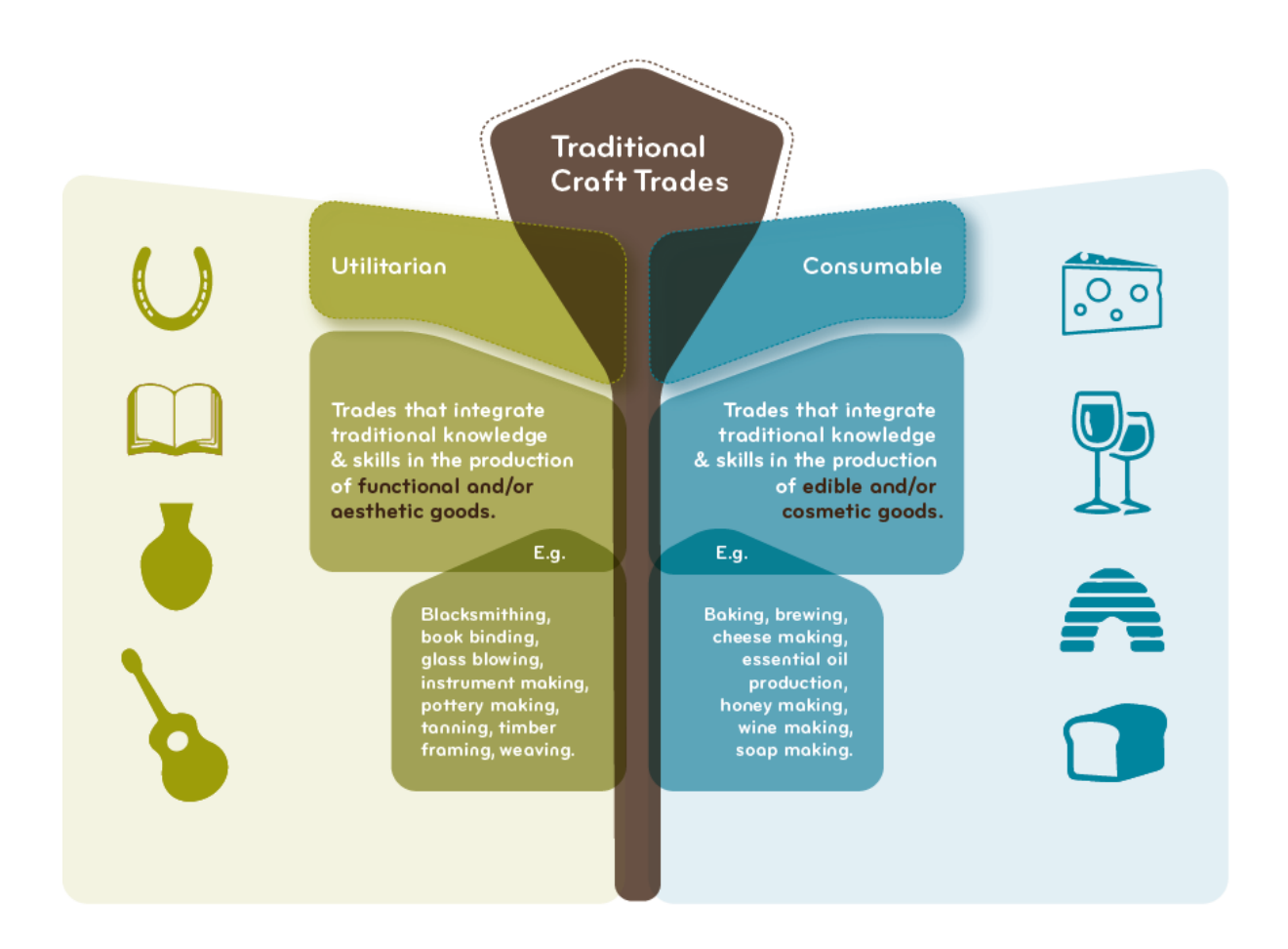
Figure 1. Typology of Traditional Craft Trades

Information about traditional craft trades is scattered, segregated and buried in more general reports on Canada's cultural and small-scale food processing industries. In order to present what is known about the training mechanisms that support the development of Traditional Craft Trades in Canada, this report synthesizes literature on the cultural sector and on the small-scale agrifood sector. Currently, these two bodies of knowledge are not addressed together in either the academic literature or government and industry reports. Whereas the cultural sector and its labour force and economic impact in Canada has been the focus of much attention in government and academic literature, TCT's reach beyond the boundaries of what is categorized as "culture" and include agrifood crafts such as micro-brewing, artisanal cheese-making, honeymaking and meat processing. This necessitates a broader scope for the knowledge synthesis of the TCT sector. The labour market needs gathered within this report have been broadly identified from the literature that does exist and provides a starting point for future research.